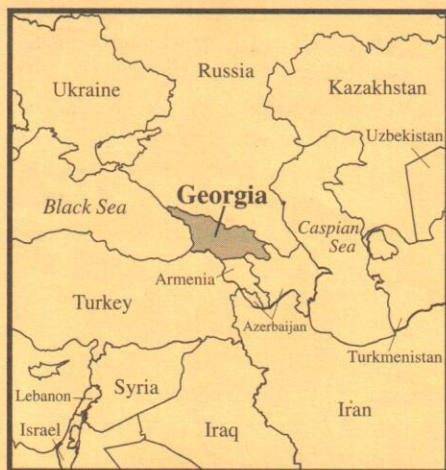
Boundary representations not necessarily authoritative.